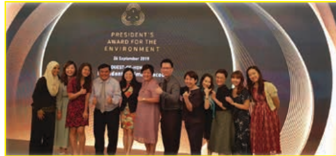
This photograph was taken in 2019 at the President's Award for the Environment ceremony.