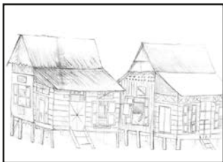
Kampong Houses in Punggol, 1958

Since Mee Toh School is located in Punggol and the majority of us live in Punggol, it is good to know more about this place. A short article like this cannot re-tell the long history of Punggol. Nonetheless, here are some interesting facts which will surprise you!